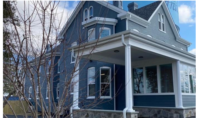
The 8,300 sf Shelter located on Hayward Road in Frederick will serve families in temporary need of emergency lodging.

"The Shelter will insure a level of normalcy for families that is important to emotional and physical stability," said Brown.