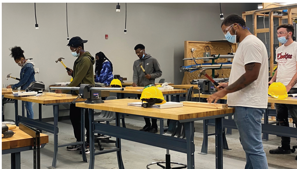
Empowered to Live's "Project GUIDE" instructs students in a wide range of classroom and practical skills that are related to the construction and trades industries.